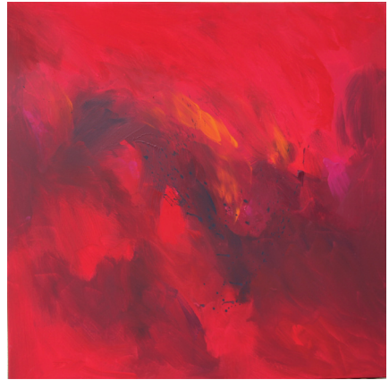
Eté Chinois I Acrylic on Canvas 31.5" x 31.5"