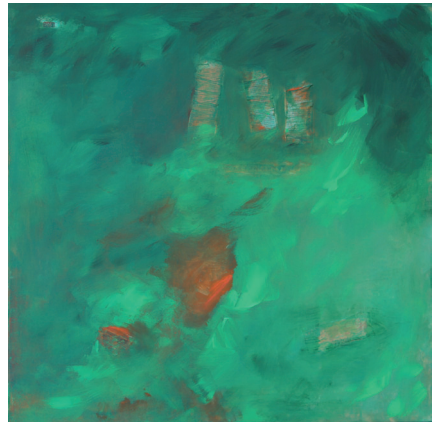
Impressions De Xi'an Acrylic on Canvas 31.5" x 31.5"