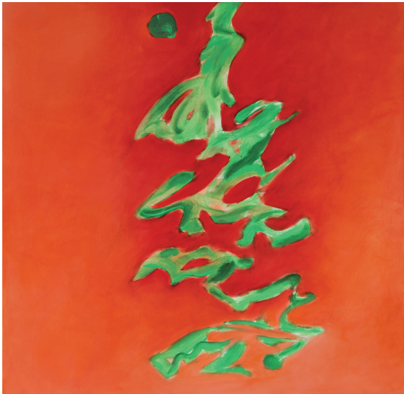
Calichi Acrylic on Canvas 31.5" x 31.5"

Exhibition Dates: November 22 - December 13, 2013