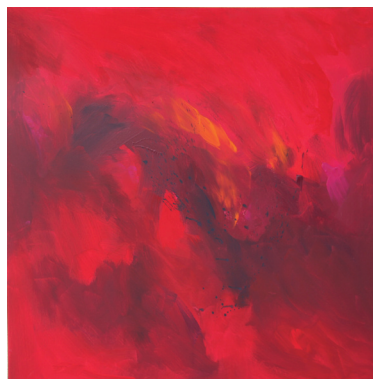
Eté Chinois I

Chelsea, New York City 212-226-4151 Fax: 212-966-4380 WWW.AGORA-GALLERY.COM WWW.ART-MINE.COM